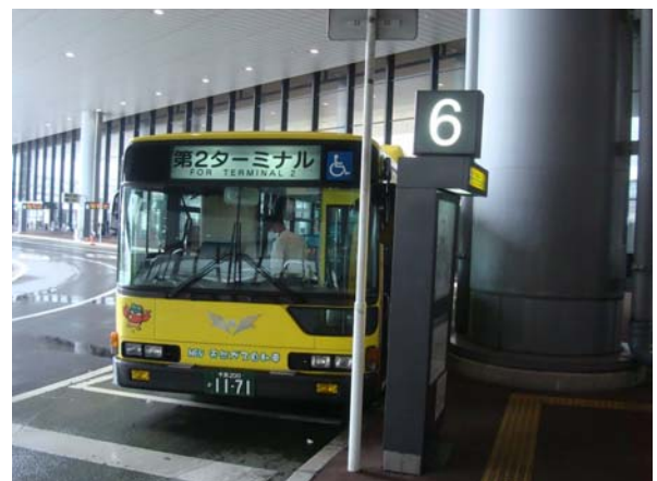
The terminal connection bus arriving at Terminal 1