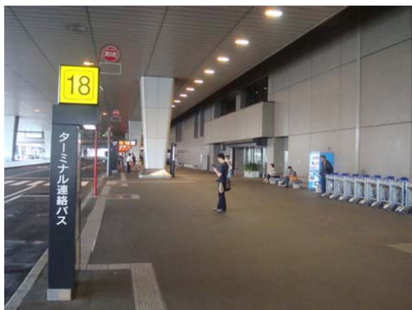
One of the stops (#18) of the terminal connection bus at Terminal 2